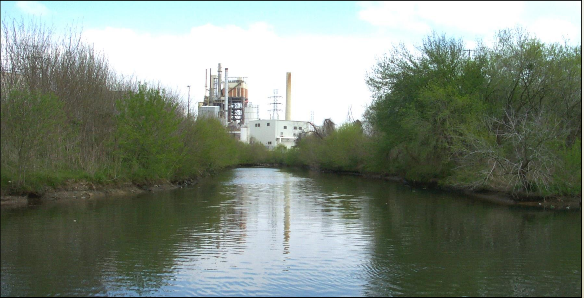
PCAC at Age 33